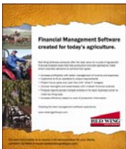
Red Wing Software