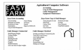
Vertical Solutions, Inc.