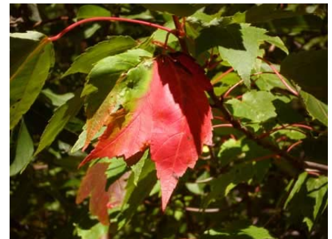
Fall foliage is starting to turn at Gooseberry Falls State Park, north of Duluth, MN.