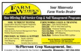
McPherson Crop Management, Inc.