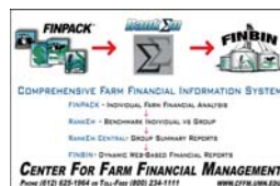
Center for Farm Financial Management