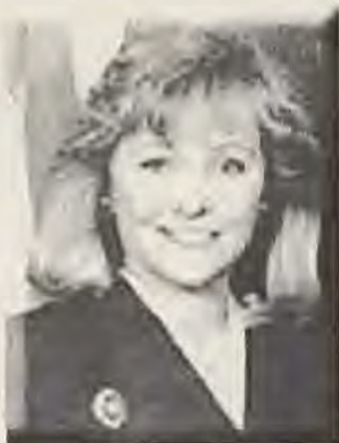
Oklahoma Lieutenant Governor Mary Fallin

Department of Agricultural Economics at Oklahoma State University - Associate Professor & Extension Livestock Marketing Specialist. Co-author of Oklahoma Market Viewpoints - monthly publication of the Oklahoma Cooperative Extension Service